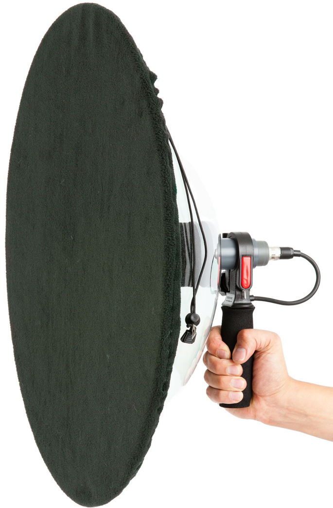
Photo: Telinga V2 dish with the Rycote Telinga Dish HWC (optional)